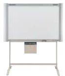
UB-7325 4-screen Standard size (shown with optional stand)