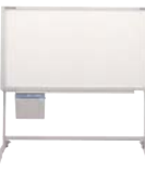
UB-5815 2-screen Wide size (shown with optional stand)