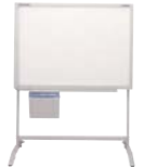
UB-5315 2-screen Standard size (shown with optional stand)