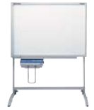
UB-5310 2-screen Standard size (shown with optional stand)

Microsoft and Windows are either registered trademarks or trademarks of Microsoft Corporation in the United States and/or other countries. Windows® is Microsoft® Windows® operating system. IBM is a registered trademark of International Business Machines Corporation. Pentium is a registered trademark of Intel Corporation in the U.S. and other countries. All trademarks referred to in this catalog are property of their respective companies. Design and specifications are subject to change without notice.